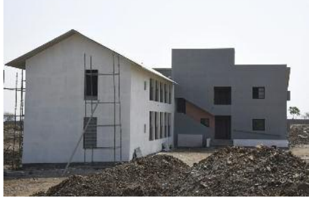
Girls' home with the first coat of paint