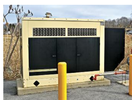
......$116,000 Back-up Power/Generators.....$40,000