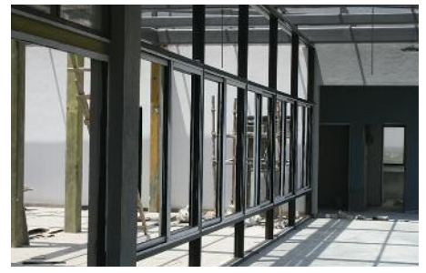
Partitions and windows installed at the school